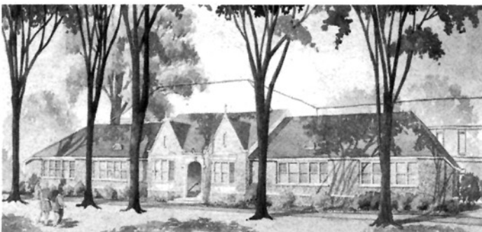
An early rendering of how the historic Pinson School can be reused with the new building addition massed to the rear.